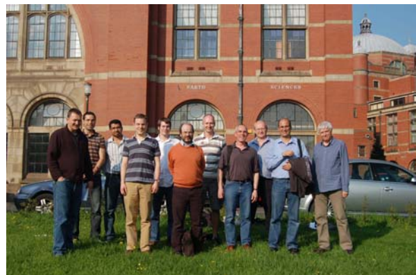
Delegates posing outside the University of Birmingham

Amr Said Deaf : Palynostratigraphy, palynofacies analysis and depositional environments of clastic lower Cretaceous sediments from the northern Western Desert, Egypt